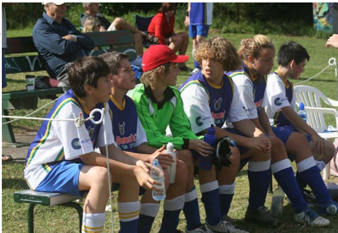
(see details of competition on page 4)

Caption: Winner of this week's 'Mimmo's Photo Of The Week Competition' is this photo showing members of U14-2s, having their half-time rest.